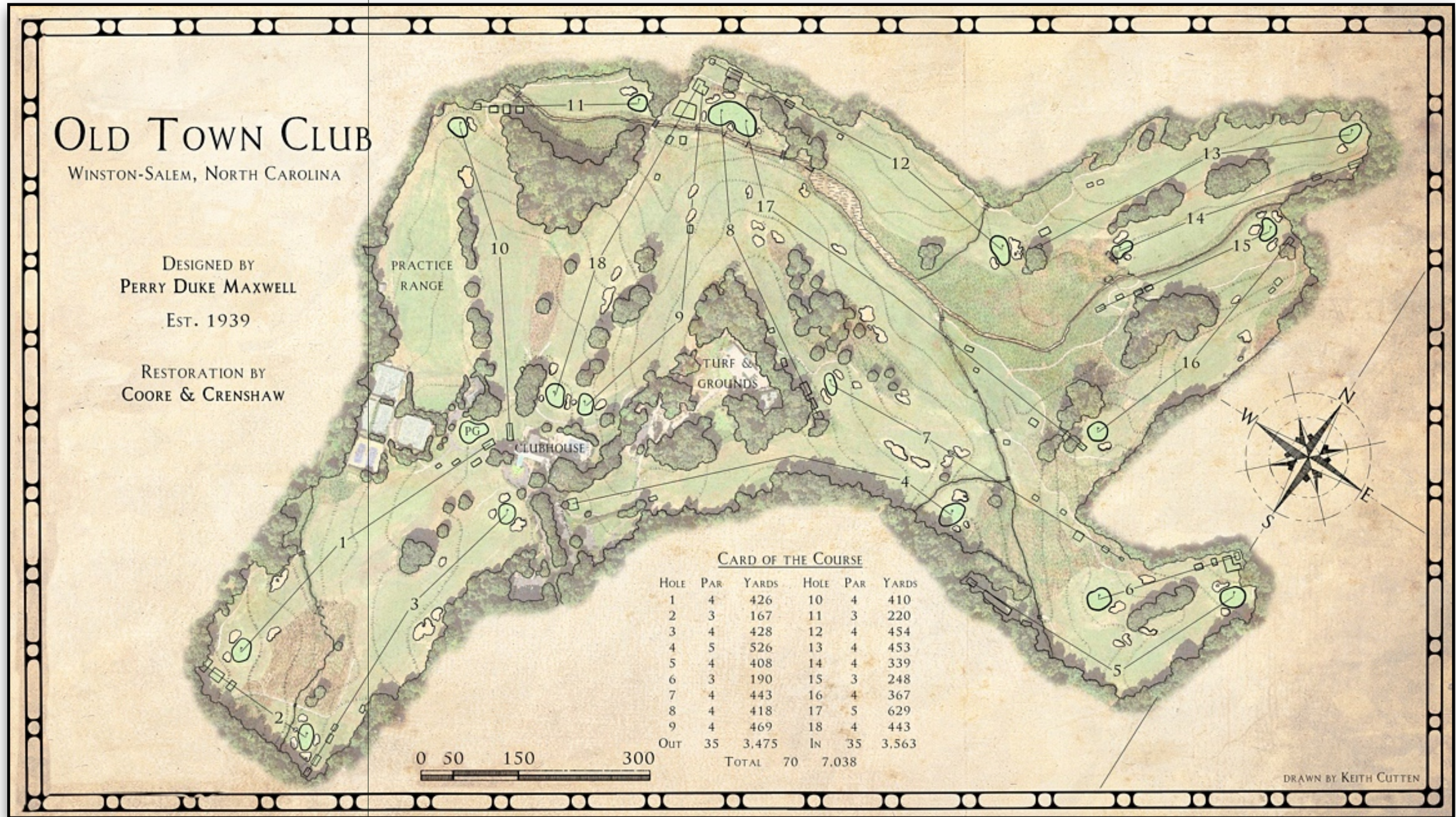
Over: Aerial view of Old Town's double-green, where four fairways merge and six holes meet creating a natural epicenter. Two miles away, the Winston-Salem skyline appears prominently in the backdrop.

It's also difficult to route a course using a single water feature so prolifically. Silas Creek looms large on more than ten holes stretching almost two miles across the heart of the property. The diversity in which the creek and its branches are used (flanking left, flanking right, diagonally across, and blindly in front of green-sites) plays a critical role of impacting hole strategies throughout the layout.