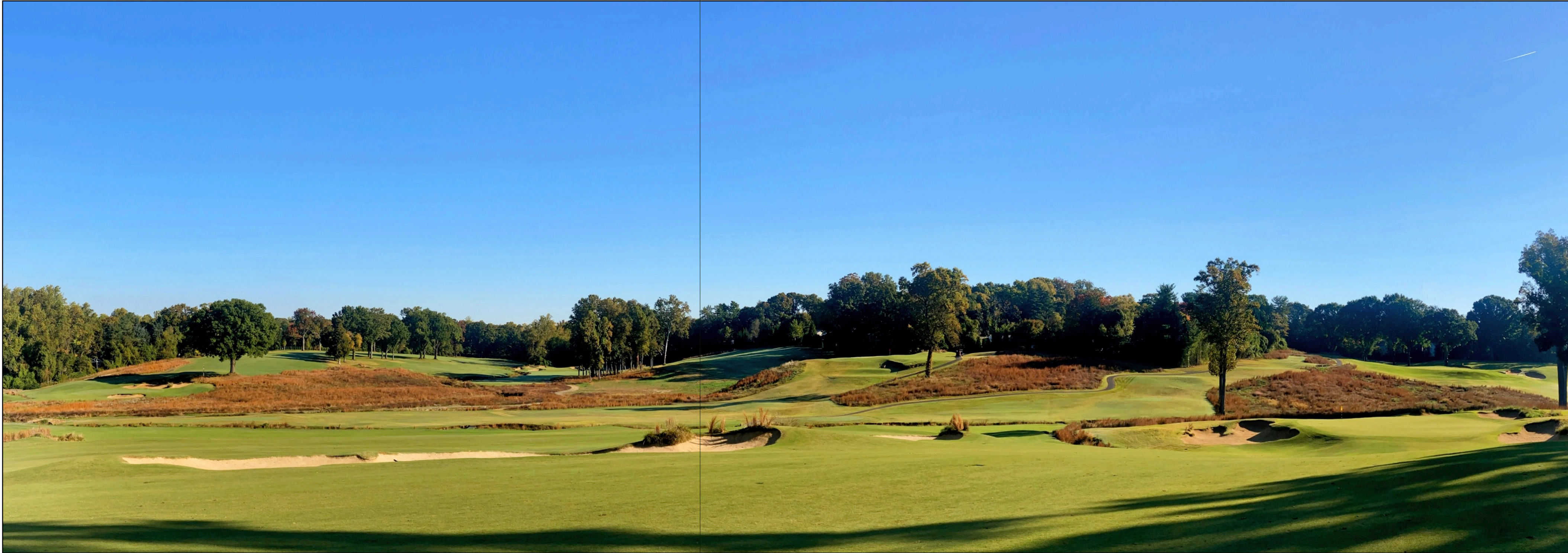
Right: The Big Reveal: nine flagsticks emerge from this vantage point. No seaside cliffs or mountain views are needed. The grandeur of open inland topography can also stir the soul. A sanctuary within city limits.